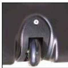
2" Ballbearing Recessed Wheels

Warranty Information: The manufacturer offers a three year warranty. The foam packs (on the inside) have a one year warranty. Foam can be replaced if needed. With normal wear the foam pack should last approximately ten years. The case is water resistant (not waterproof). The tongue-in-groove seat on the cases will prevent moisture from entering for a short time (ex. moving from the car to the building), but cannot be depended upon to protect bells if left outside for extended periods of time. 12/07