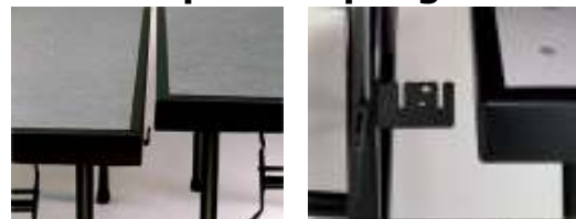
Couplings securely joins sections