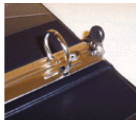
3-Ring Hardware w/Padded Booster Ring