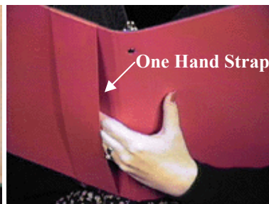
One Hand Strap

Each folder has the same design, including - two vertical pockets (not see-through) one back hand strap , and nylon mesh reinforcement in the spine . Book Cloth folders are available in Hymnal Cloth, Library Buckram, and Bonded Leather. Request swatch card for color selection. Lifetime Warranty on rivets and hardware.