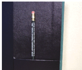
Optional Pencil Pocket