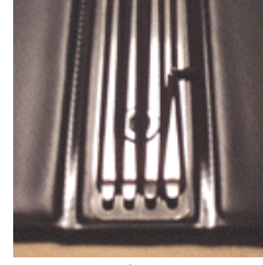
Elastic Band Hardware