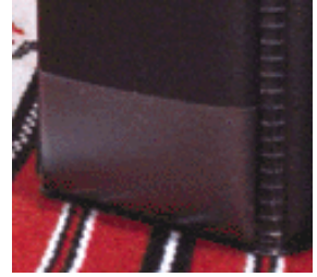
Optional Spine Pocket